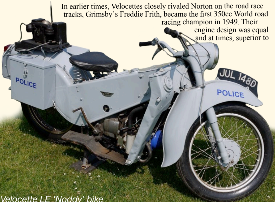
Velocette LE 'Noddy' bike

In earlier times, Velocettes closely rivaled Norton on the road race tracks, Grimsby's Freddie Frith, became the first 350cc World road racing champion in 1949. Their engine design was equal and at times, superior to